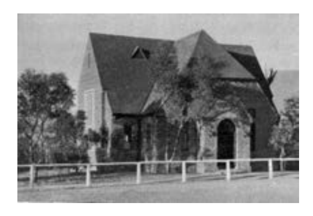
The House of Music.

Some of the more fortunate of us were able to visit Melbourne and see a performance of Swan Lake, Cinderella and the Prodigal Son by the Covent Garden Russian Ballet. At the conclusion of these ballets we investigated the mysteries of back stage and found them very interesting.