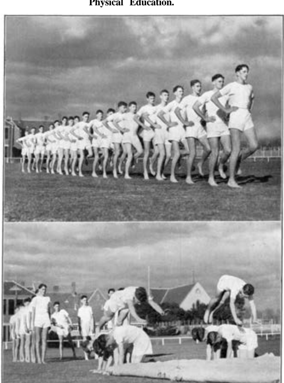
JUNE, 1939. Physical Education.