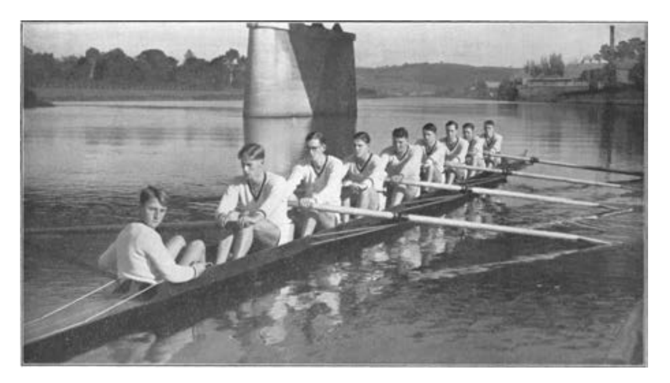
THE VIII, 1939.