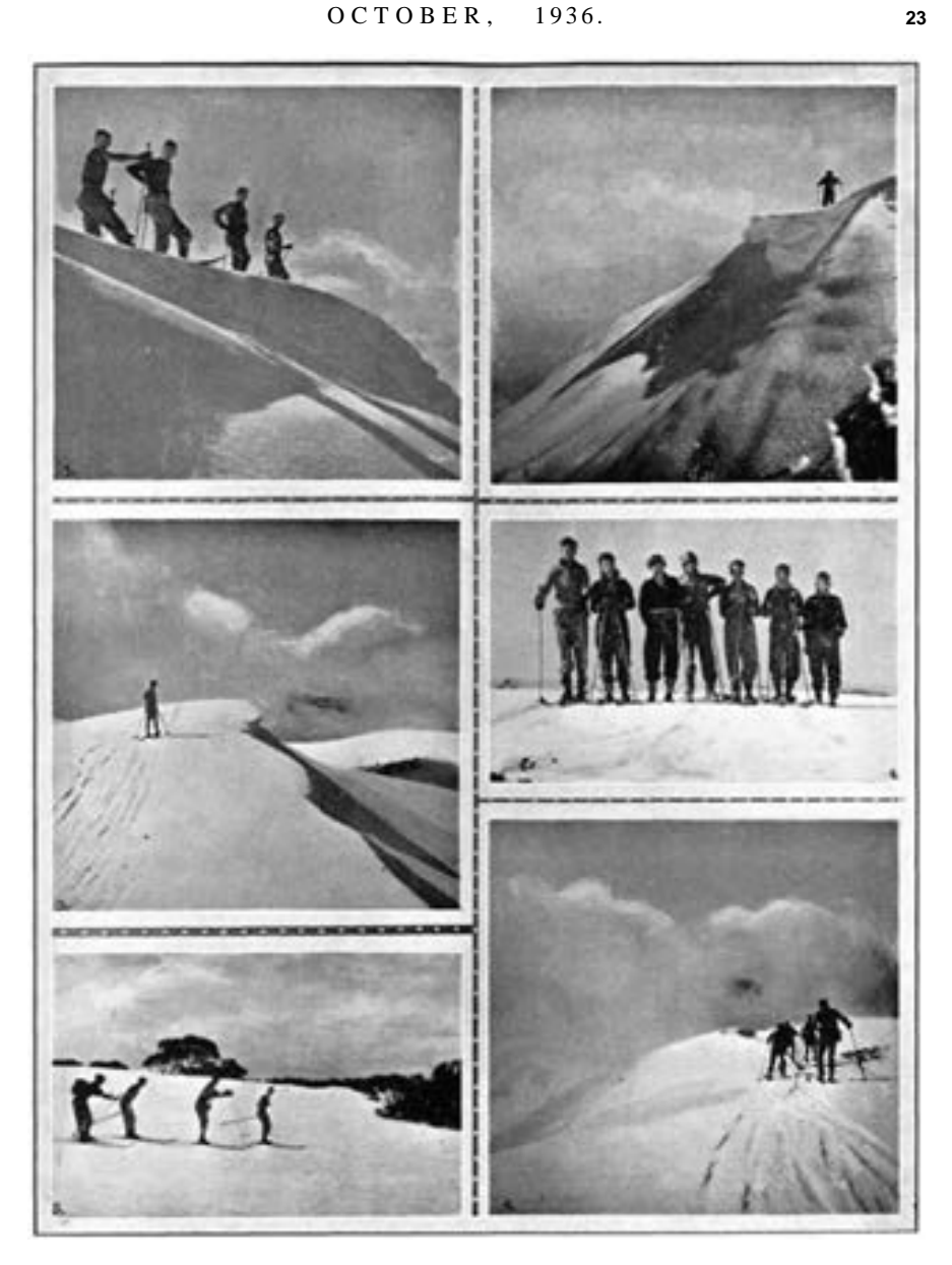
Sport in the Snowfields.