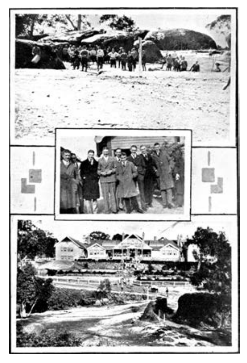
Top: Nature's Winter Playground. Centre: The party at a wayside station. Bottom: The Chalet.