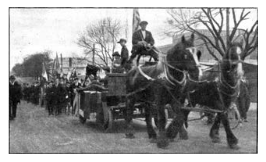
THE PROCESSION PREPARING TO MOVE.

After the completion of the speeches the procession was reformed. It moved up Fenwick St. and then swung round to Ryrie St. Instead of going up Latrobe Terrace the guns were hauled along Aberdeen St. the City Band leading the procession, while the College boys hauled the