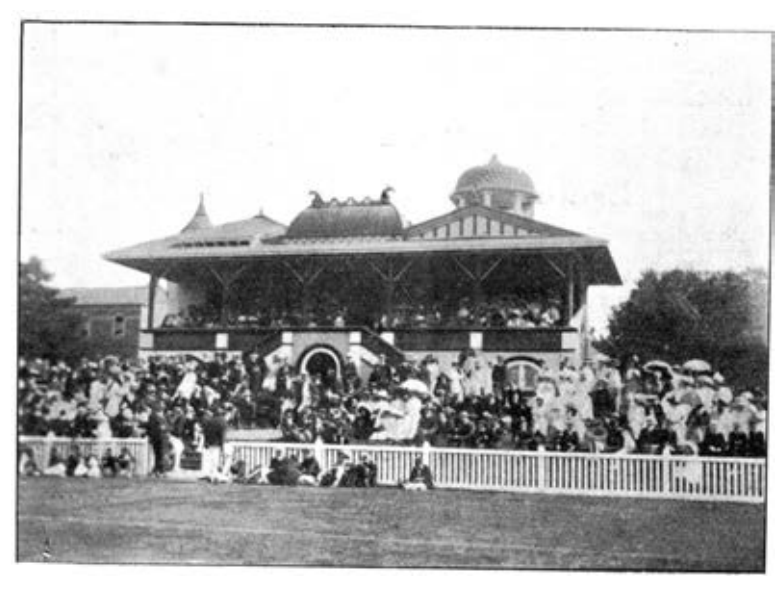
THE PAVILION, OLD BOYS DAY.