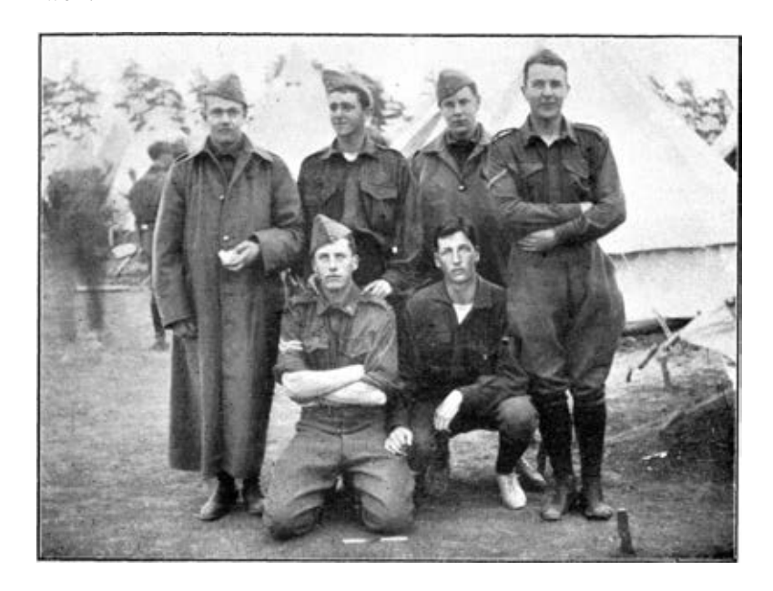
OUR CITIZEN FORCES IN CAMP.

On Tuesday an early start was made, the battalion marching off at 8 o'clock. The whole day was spent in making an advance over rough country under supposed artillery and infantry fire. However, we finished up with a briliant charge across a ploughed field, which must have quite unnerved the enemy. Wednesday and Thursday were spent in something the same way, only on each day we worked over a new piece of country; so that now we know all the country within a radius of about five miles of Broadmeadows pretty well.