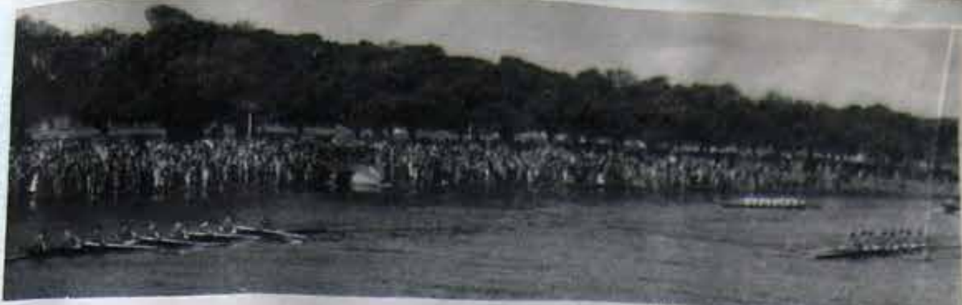
FINISH OF HEAD OF THE RIVER, 1957.