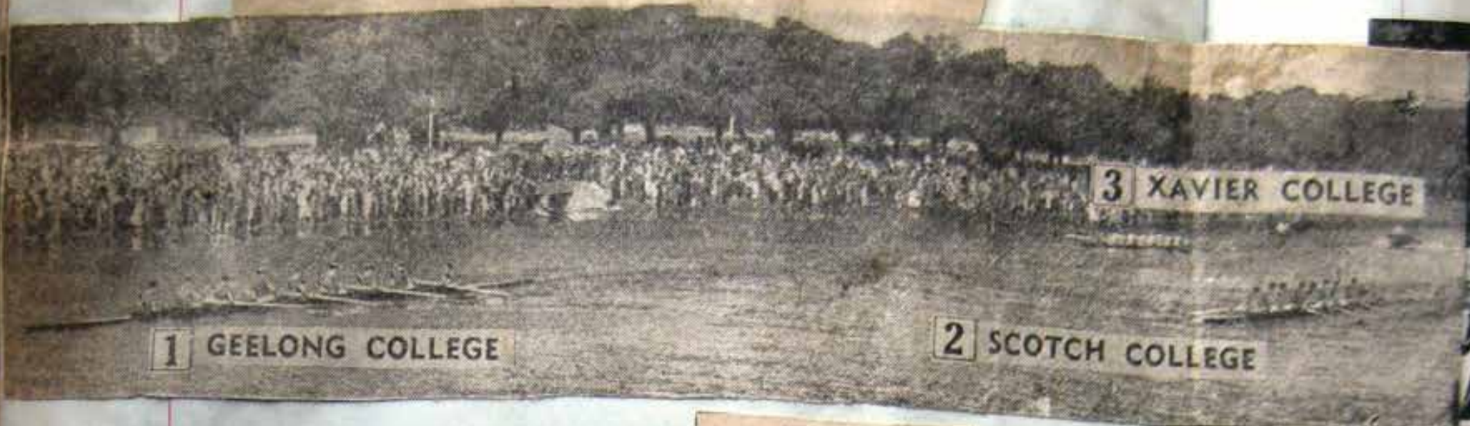
1 GEELONG COLLEGE