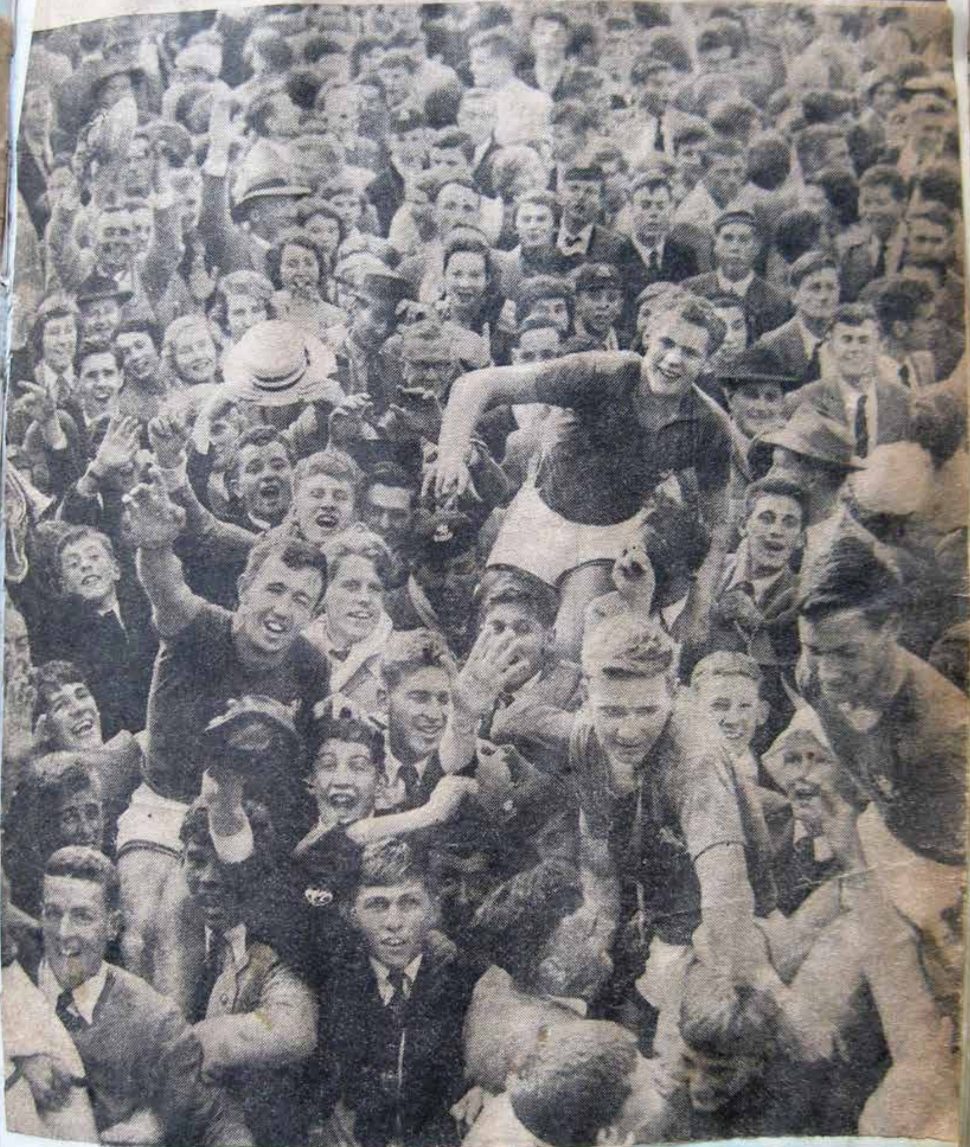
↑ SOME of Geelong College's crewmen are carried shoulder-high by enthusiastic supporters after Geelong had won the Head of the River title on the Yarra on Saturday. Scotch College was second and Xavier College third.