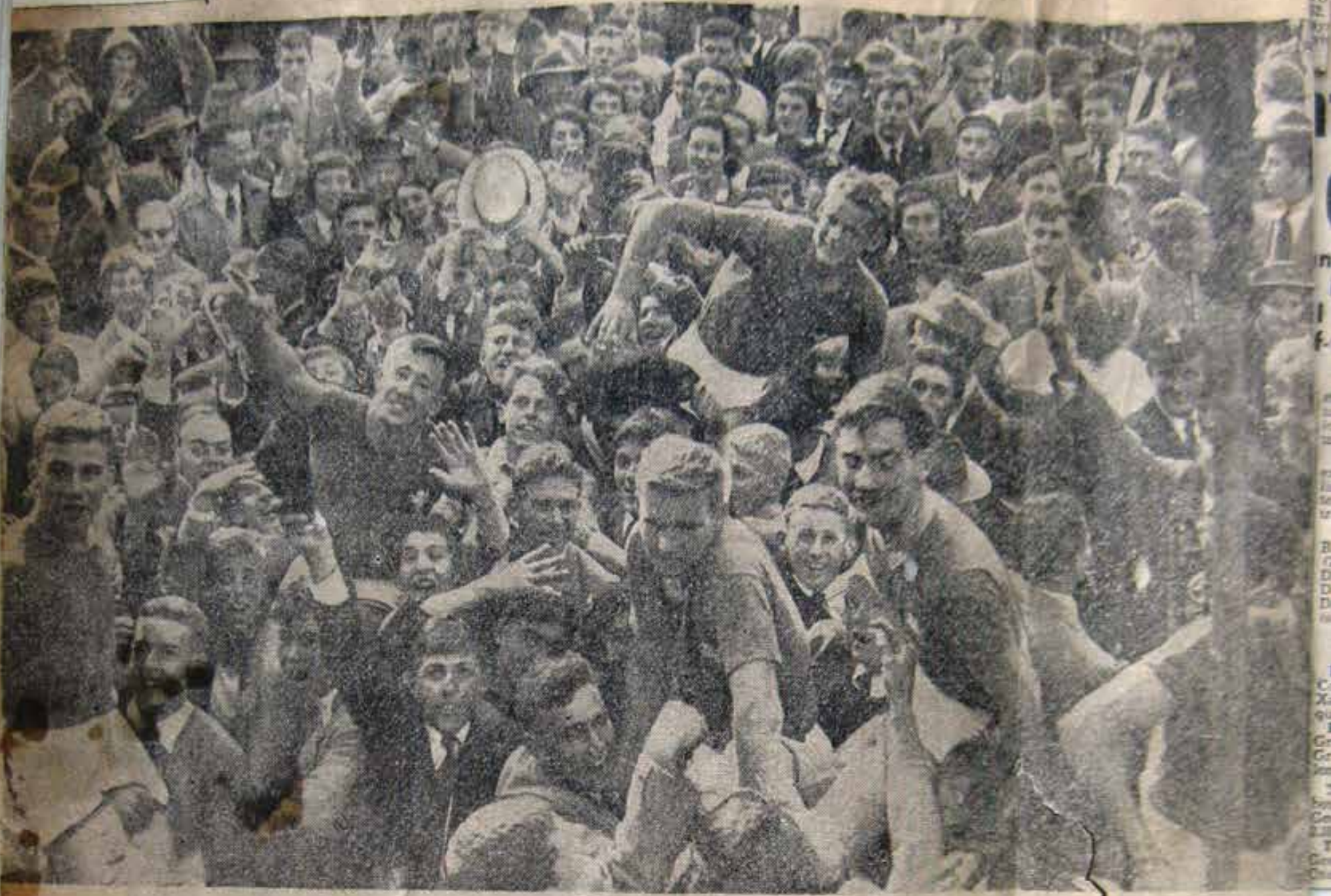
ENTHUSIASTIC SCHOOL MATES "chair" the Geelong College crew back to the boatsheds after their Head-of-the-River win on the Yarra on Saturday. It was