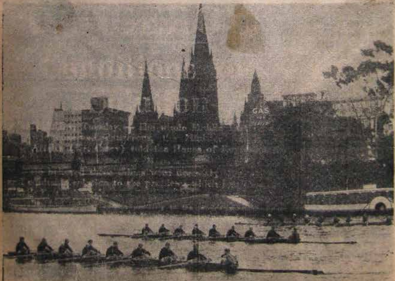
TODAY'S HEAD-OF-THE-RIVER HEATS will be the first to be decided on the Yarra since 1947. A switch to Geelong became necessary when work began on the new Swan Street bridge. Against a background of familiar city landmarks, the Geelong College crews obtained some last-minute training yesterday.